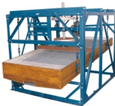
Rotary Sieve Type