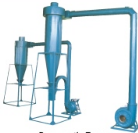
Pneumatic Type with Double Cyclone & Double Blower